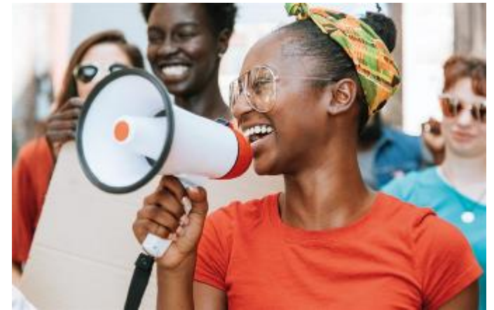
Lobbying (Wales Council for Voluntary Action, UK 2019 general election)