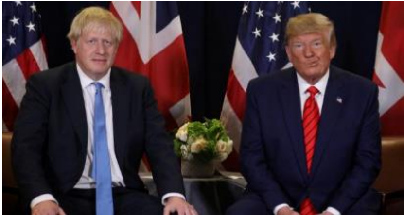
Diplomacy (Irish Times, 28/12/19)