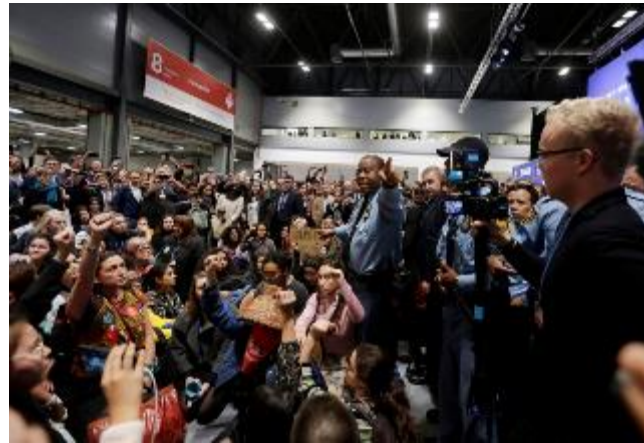
Negotiation nationalobserver.com 15/12/19